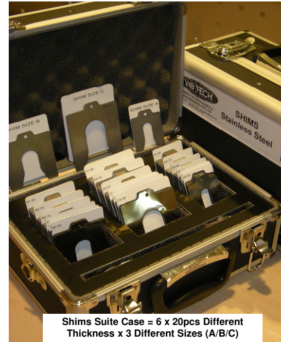
Shims Suite Case = 6 x 20pcs Different Thickness x 3 Different Sizes (A/B/C)